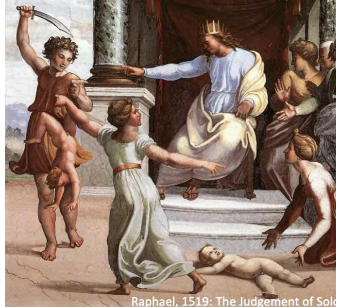
Raphael, 1519: The Judgement of Solomon

I replied: "Give the living child to the first woman, and by no means put him to death; she is his mother".