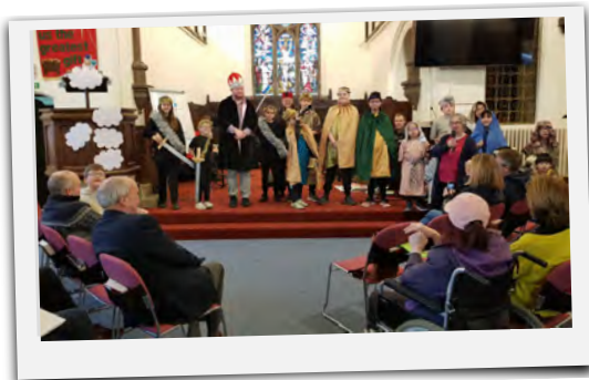
Nativity from Scratch