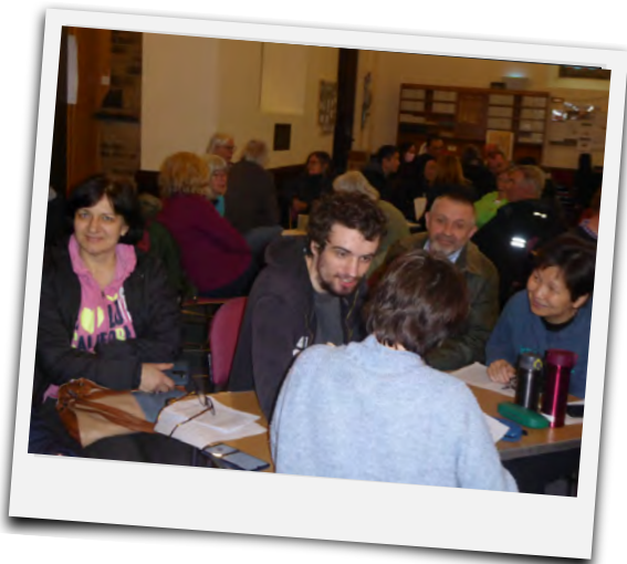
Church weekend at home